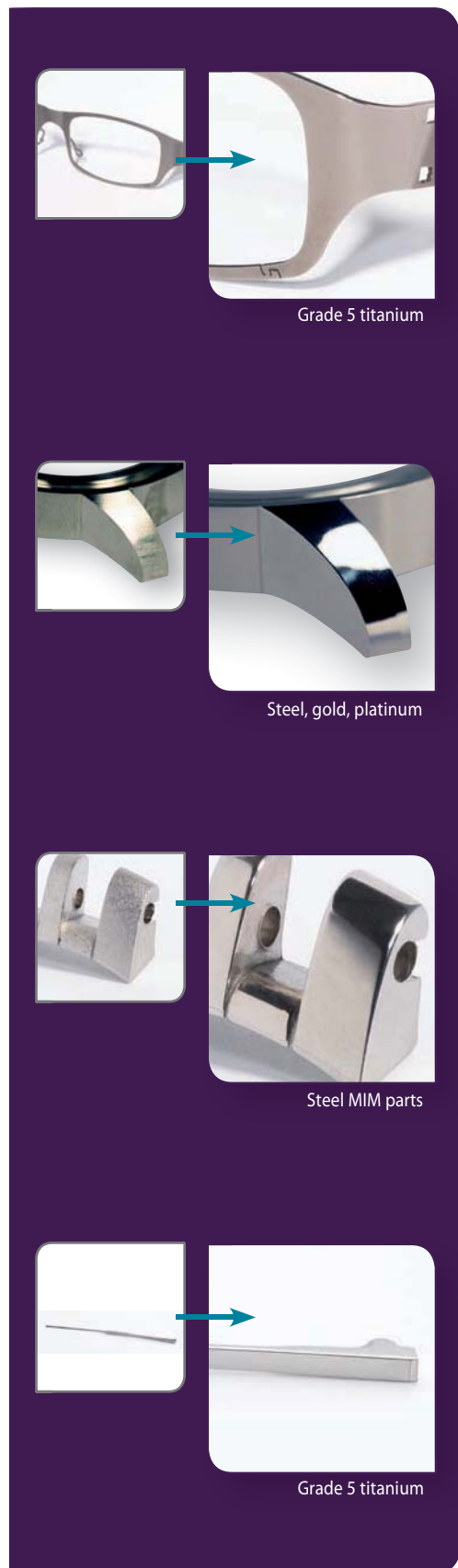
Grade 5 titanium